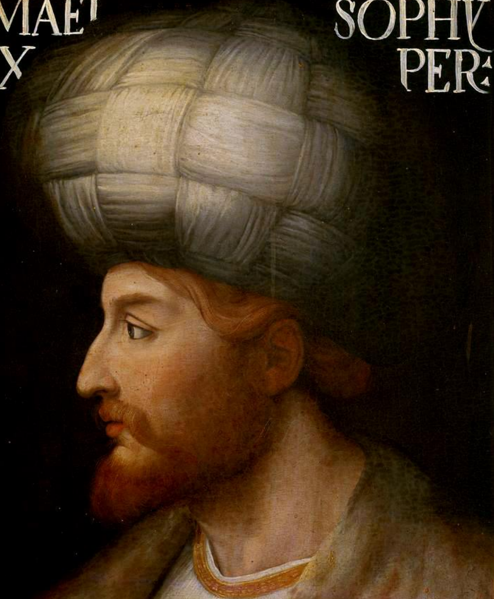
Shah Ismail (d. 1524), founder of the Safavid Empire. Anonymous Venetian Portrait Florence, Uffizi Gallery.