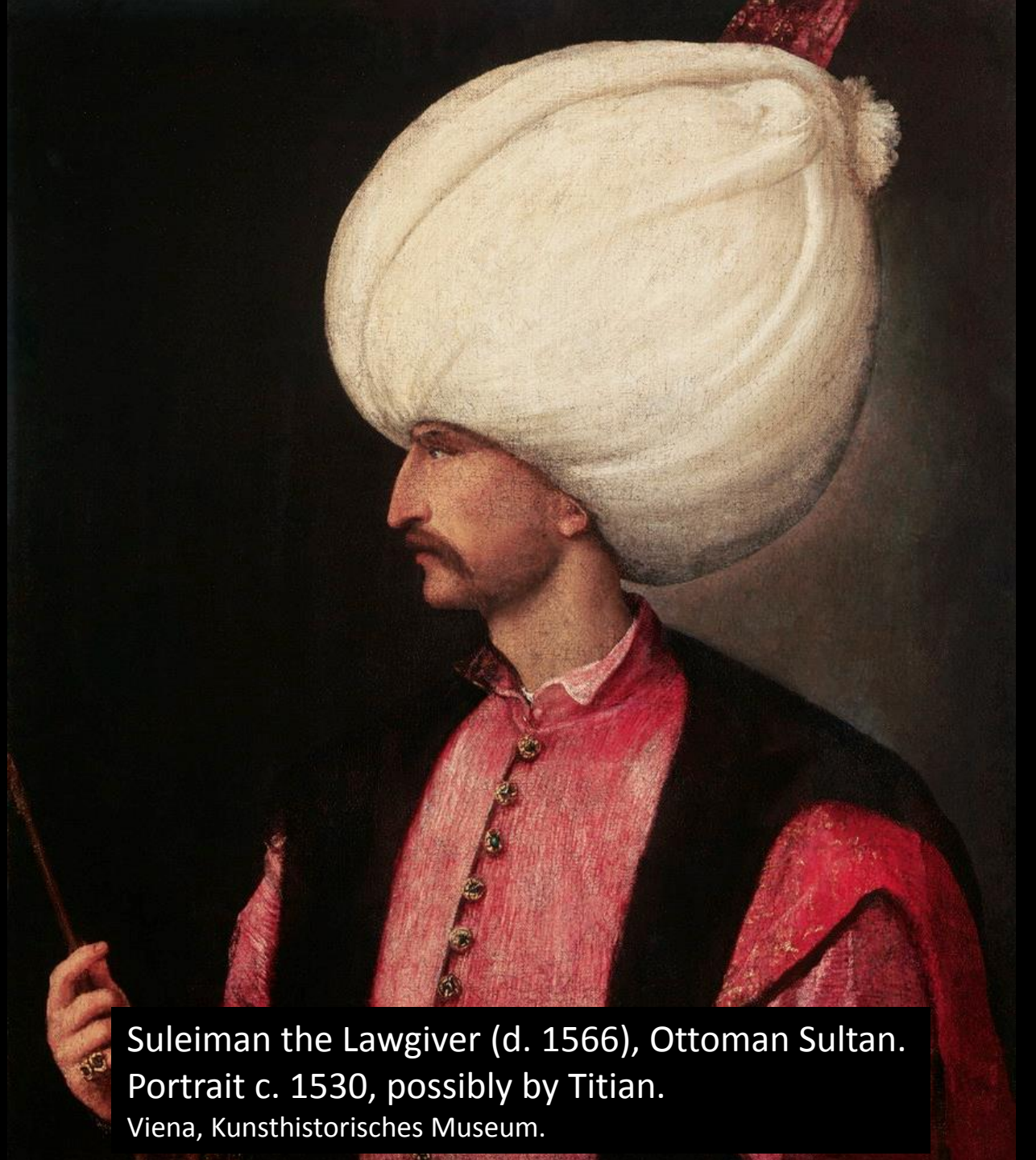
Suleiman the Lawgiver (d. 1566), Ottoman Sultan. Portrait c. 1530, possibly by Titian. Vienna, Kunsthistorisches Museum.