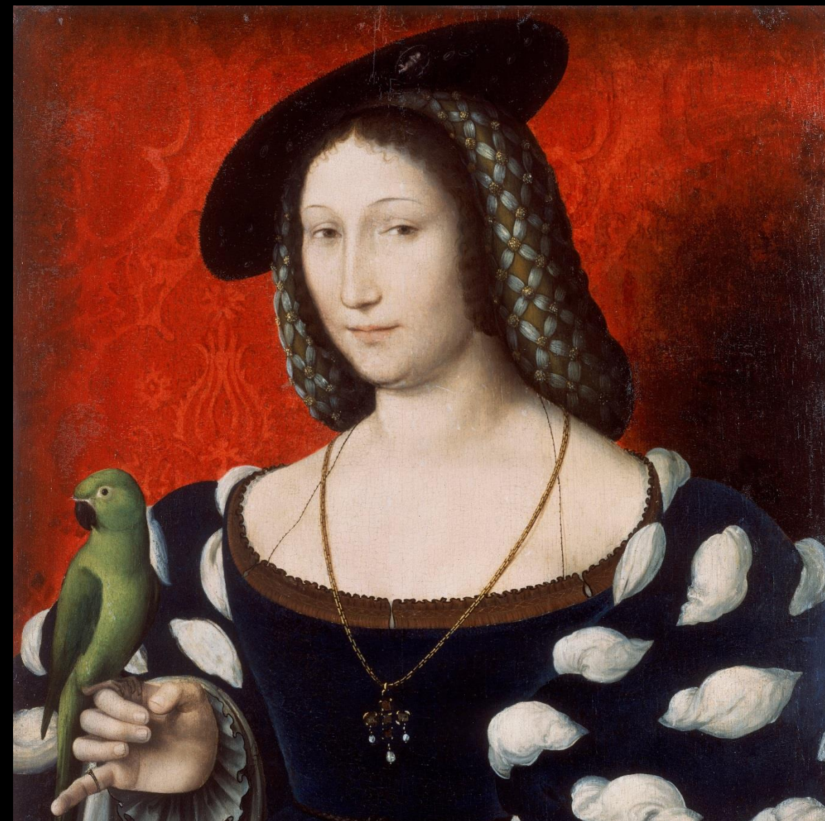
Marguerite d'Angouleme, Queen of Navarre, promoter of evangelicals, and spiritual writer (d. 1549). Portrait by Jean Clouet, c. 1530.