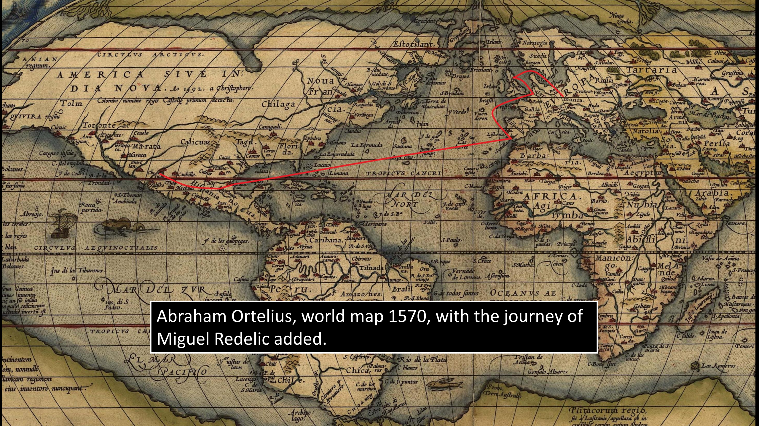
Abraham Ortelius, world map 1570, with the journey of Miguel Redelic added.

Plitacorum regio, sic a Lusitanis appellata ob in- credibile eorum avium indem