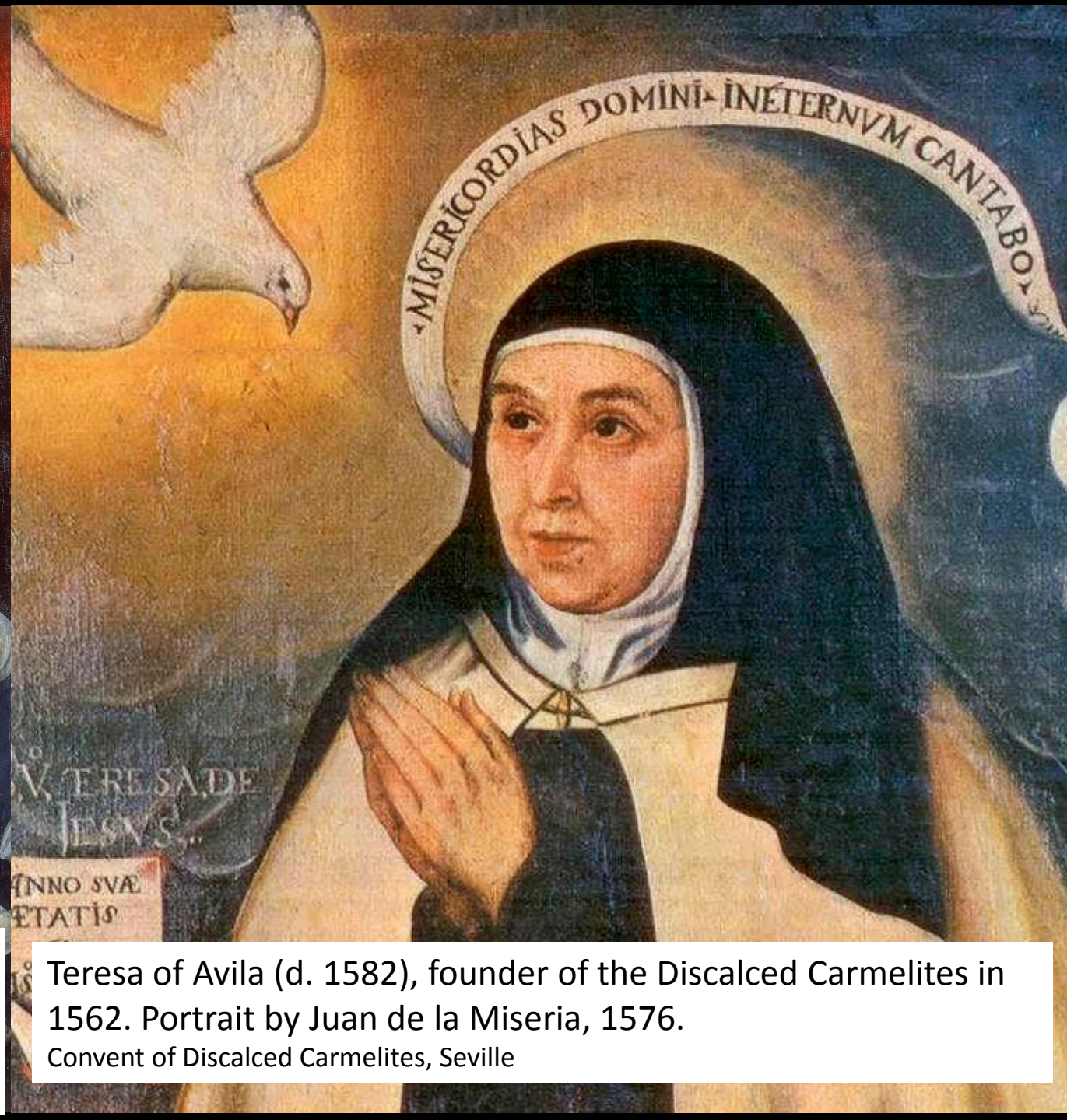
Teresa of Avila (d. 1582), founder of the Discalced Carmelites in 1562. Portrait by Juan de la Miseria, 1576.

Convent of Discalced Carmelites, Seville