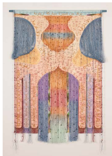
Tree of Light, Laurie Wohl.